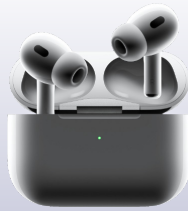
Apple AirPods No. of Lots 300