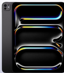
iPad Pro No. of Lots 1,500