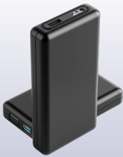
Power Bank No. of Lots 50

Complete targeted trading volumes in 30 days to unlock exclusive rewards. The more you trade and achieve milestones, the better the prize.