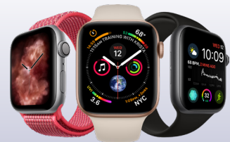
Apple Watch No. of Lots 500