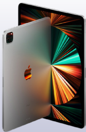
iPad No. of Lots 1,000