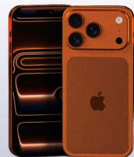
Latest iPhone No. of Lots 2,000